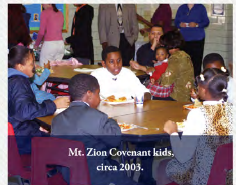
Mt. Zion Covenant kids, circa 2003.