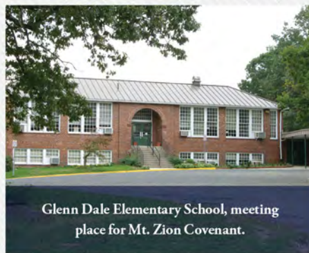
Glenn Dale Elementary School, meeting place for Mt. Zion Covenant.