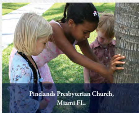
Pinelands Presbyterian Church, Miami FL.