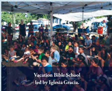
Vacation Bible School led by Iglesia Gracia.