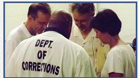
Prayer with inmate following Choral Worship Service.