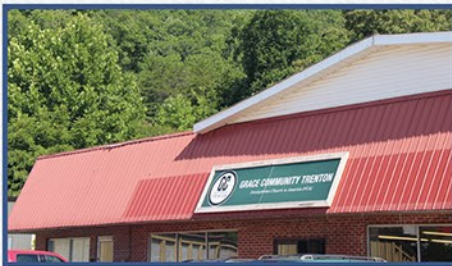
Grace Community Church, Trenton GA.

If looking for Grace Community Church in Trenton GA, you'll find them gathering for worship at the Handyman Salvage building where they have met since the fall of 2014.