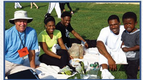
Mentor with 3 generations of mentee family, Family Day 2014.