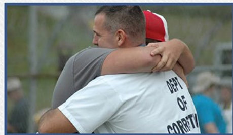
Father and son reunion, Family Day 2015.

The choirs of Chattanooga churches First Presbyterian, Covenant Presbyterian, and New City Fellowship have provided worship music in prison services, along with