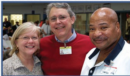
Closer than brothers – mentor and wife, with mentee.

And the ministry continues as prisoners are paroled. "At First Presbyterian, we have five ex-prisoners as members of the church. Three prisoners are members, even while they are serving life sentences, because they understand the importance of belonging to the local church. I count it an honor to serve on the church session. More than 100 people from First Presbyterian are in some way involved in this ministry. It has been awesome to see God work in the hearts of