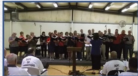
Choir from First Presbyterian leading worship.

The mentoring ministry was launched in 2012 through the leadership of 15 men from First Presbyterian in Chattanooga. Today the ministry has 107 active mentors from 42 different churches in the community. Metanoia hosts a weekly service at the prison, with an additional Friday night chapel service hosted by Grace Presbyterian in Dalton GA.