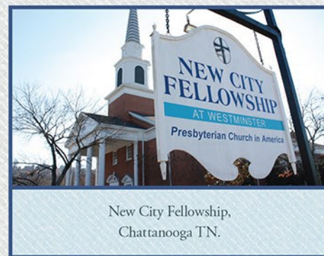
New City Fellowship, Chattanooga TN.

Prison Ministry at Walker Valley State Prison See article overleaf this issue of Multiply .