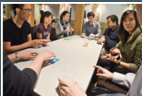
A game of Dutch blitz at Grace Toronto Game Night, an event that helps connect newcomers to the church.