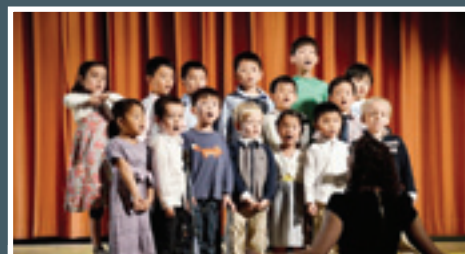
The Children’s Ministry perform a special song for Easter Sunday 2012.