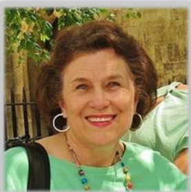
Robyn Granberry Media/Publications