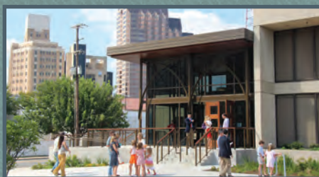
Committed to serving the city, Redeemer purchased a building close to downtown San Antonio