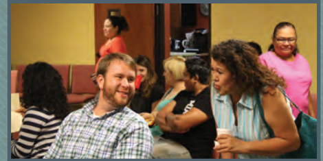
Cristo Rey Spanish-language prayer group