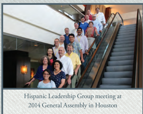
Hispanic Leadership Group meeting at 2014 General Assembly in Houston