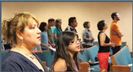
Cristo Rey congregation