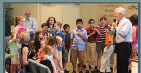
Christ Presbyterian Vacation Bible School participants

Many communities are home to first-generation immigrants, but second- and