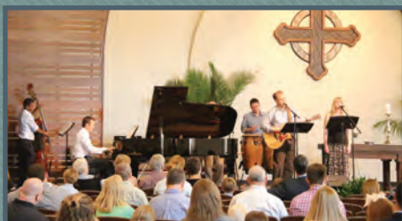
Redeemer Church in San Antonio