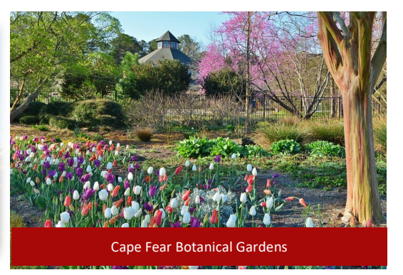
Local Highlights Candidate Strengths