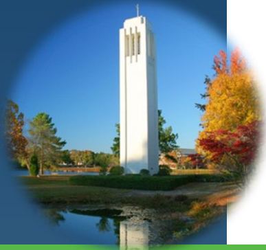
St. Andrews University Bell Tower

Richmond Community College offers an early college program for high school students on the St. Andrews campus