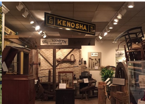
Kenosha History Museum