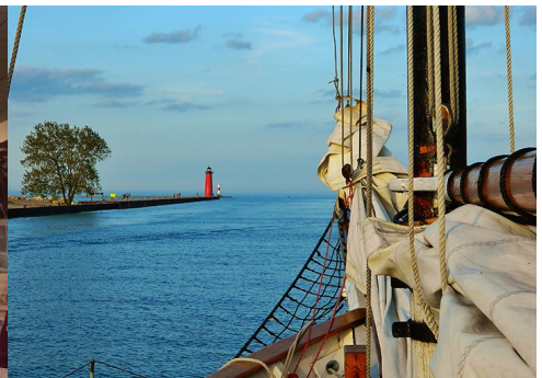
North Pier Lighthouse, Lake Michigan