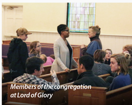
Members of the congregation at Lord of Glory