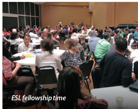
ESL fellowship time